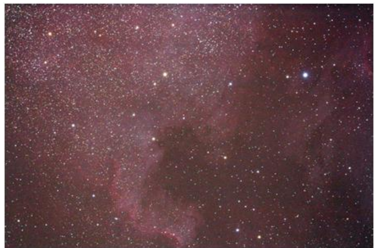
← Horse-head and ↑ North America Nebulas