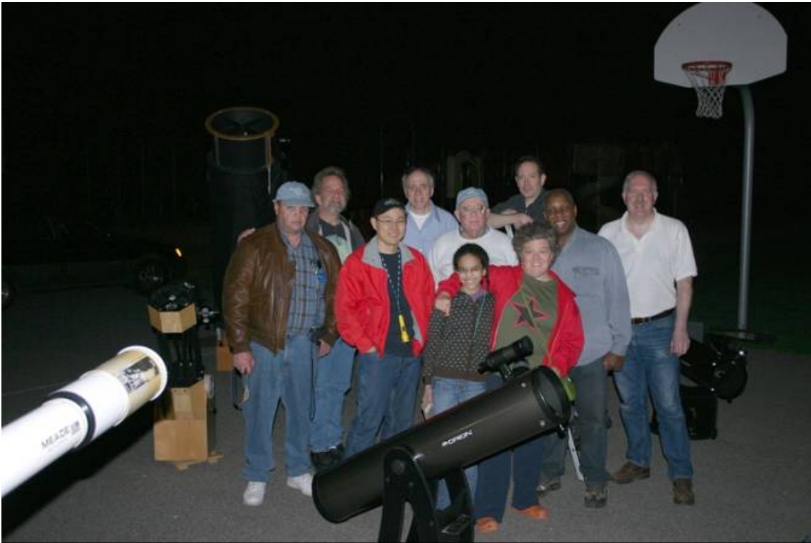
▲ Group Photo at GW