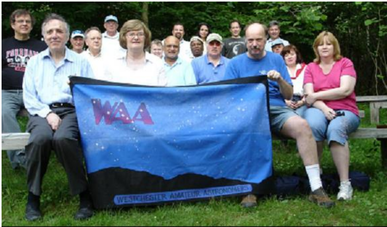
A late-day group shot of club members with the WAA banner.