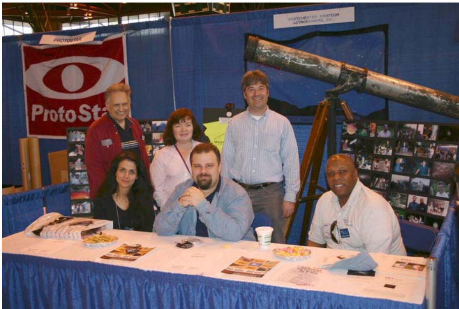
◀ WAA Members pose for a group shot at NEAF