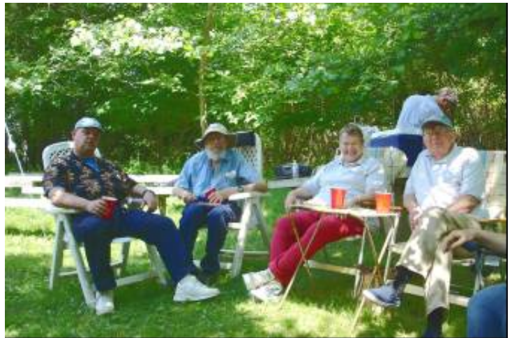
▲ Kicking Back