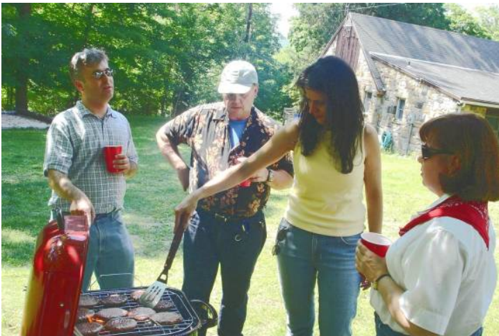
▲ Flipping Burgers